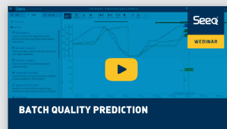
Video: Predicting batch quality with advanced analytics