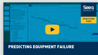
Video: Predicting Equipment Failure