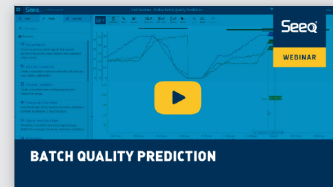
Video: Predicting batch quality with advanced analytics