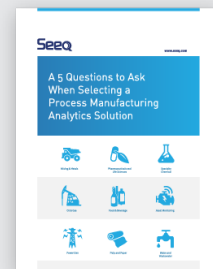
White Paper: 5 Questions to Ask When Selecting a Process Manufacturing Analytics Solutions