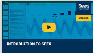
Webinar: Intro to Seeq