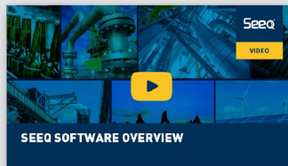
Video: Seeq Overview