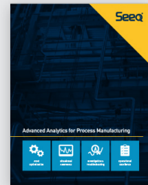
Brochure: Seeq Overview