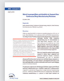
Case Study: Merck Leverages Data and Analytics to Support New Continuous Drug Manufacturing Processes