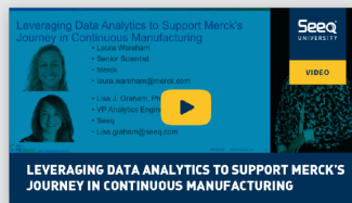
Video: Leveraging Data Analytics to Support Merck's Journey in Continuous Manufacturing